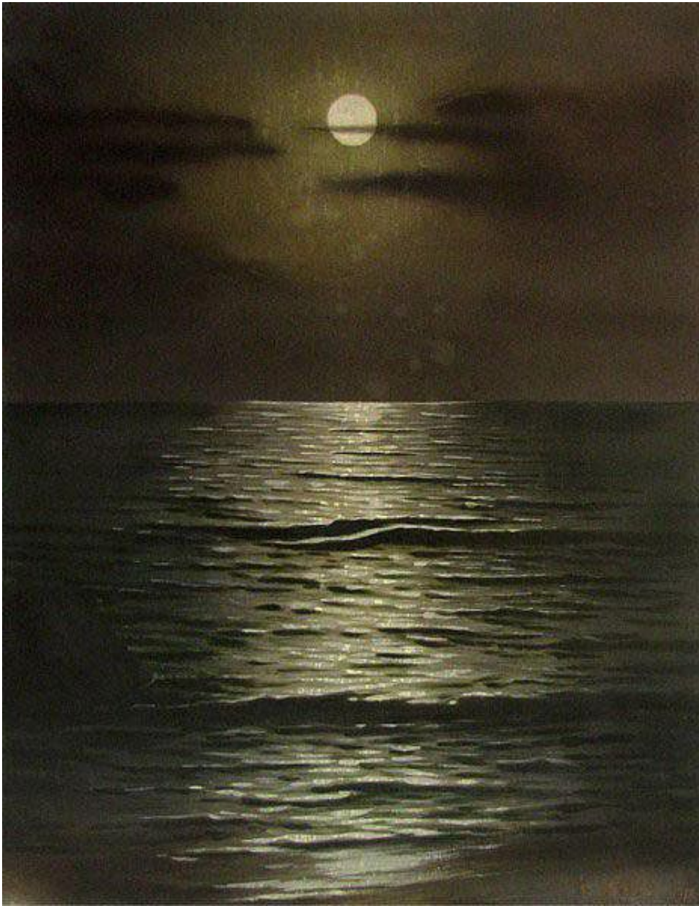
Nocturnal Sea by A. H. (1913)

We are the music makers, And we are the dreamers of dreams, Wandering by lone sea-breakers, And sitting by desolate streams;— World-losers and world-forsakers, On whom the pale moon gleams: Yet we are the movers and shakers Of the world for ever, it seems.