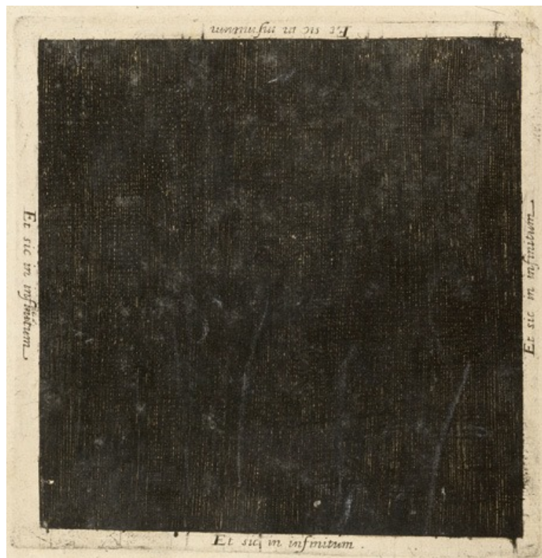
The Nihil by Robert Fludd (1617)

The evidence is in abundance from the Prima Materia (ovule primordia).